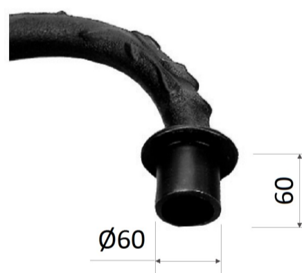
Spigot ending arm